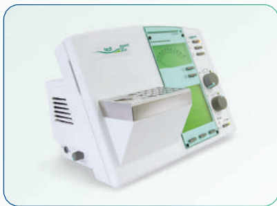
Test Expert Plus