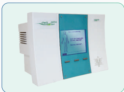
Check Medical Sport