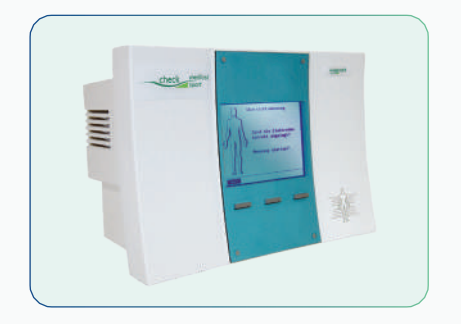
Check Medical Sport