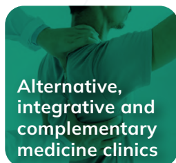
Alternative, integrative and complementary medicine clinics