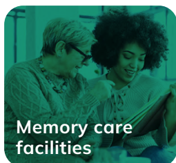
Memory care facilities