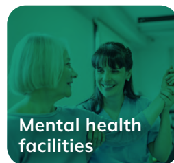
Mental health facilities