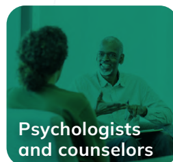
Psychologists and counselors